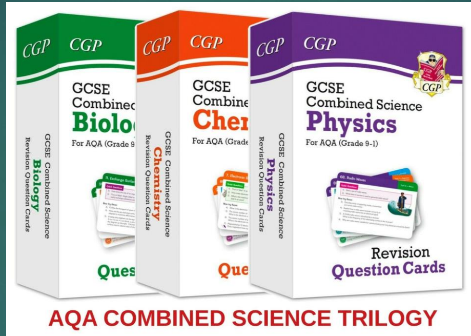
AQA COMBINED SCIENCE TRILOGY